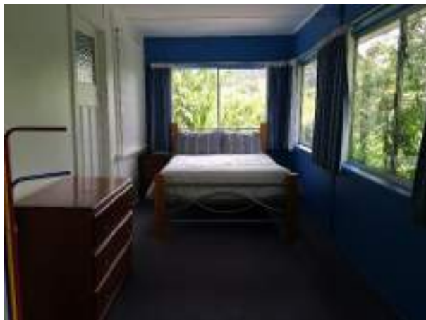
2 of the Double Rooms