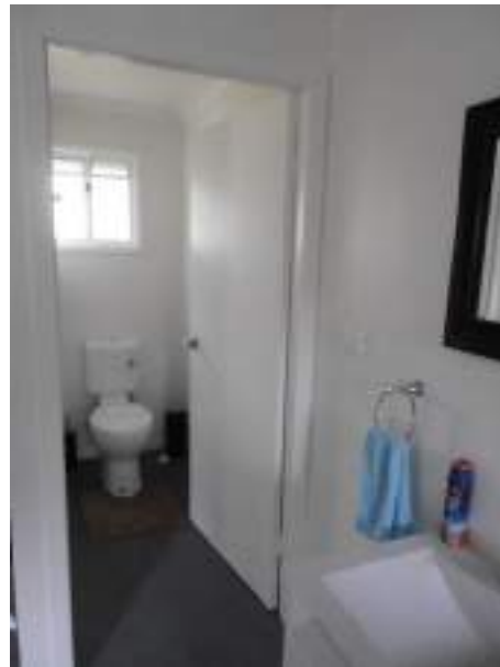
Toilet Room with basin in between