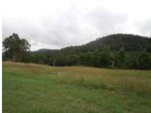
View from outside