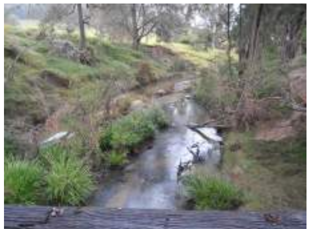
Creek crossing – there is a bridge!!