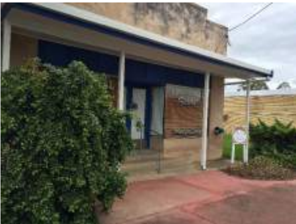
Bonalbo Old Butchers shop