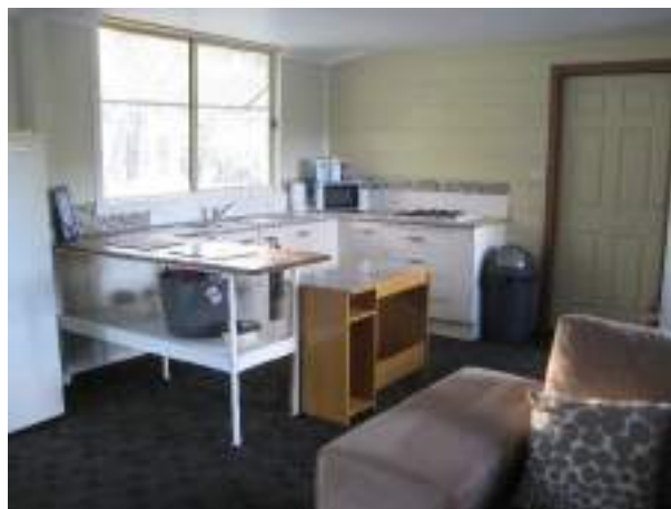
Lounge and dining area