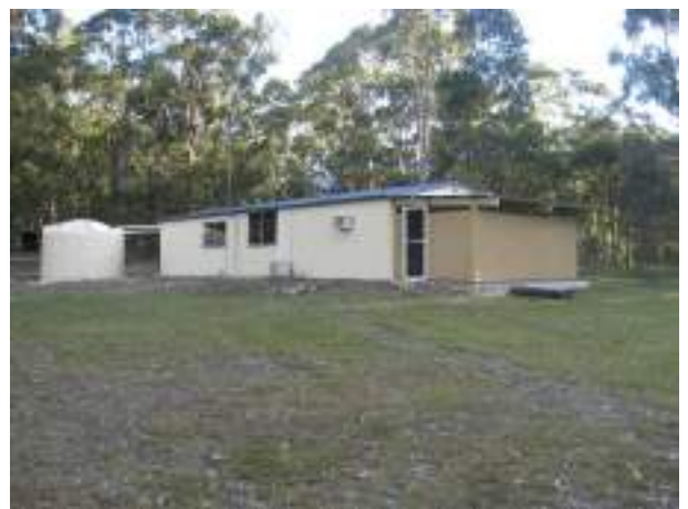
Outside view showing covered in patio