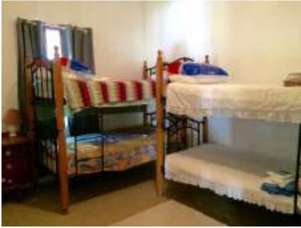
Bedroom 4 – 4 singles