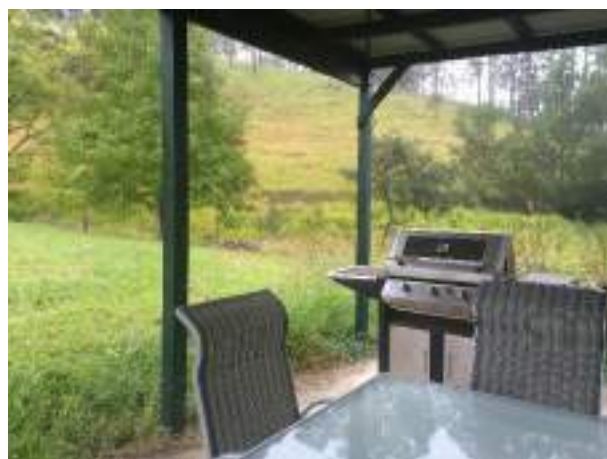
Outside BBQ area