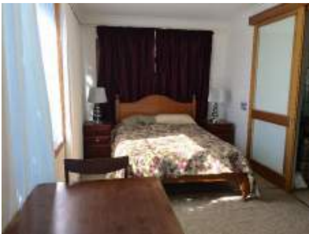
Bedroom 1 – double