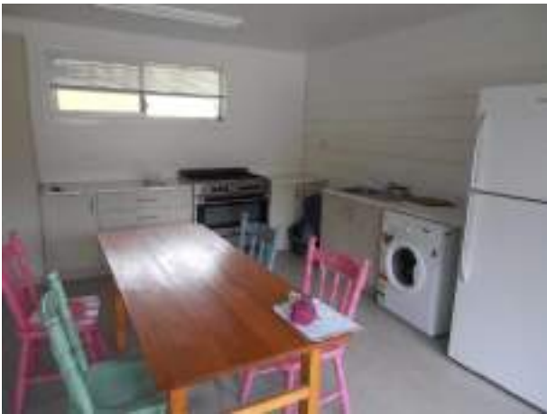
Common area – TV on wall