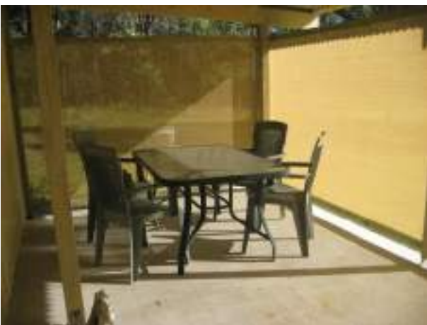
Covered in patio