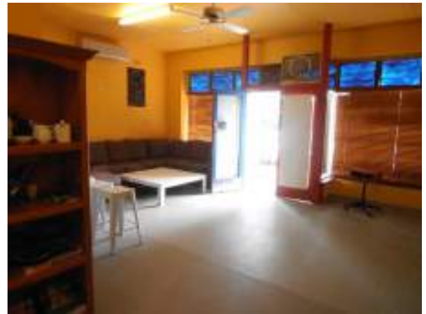
Dining area – normally a table here