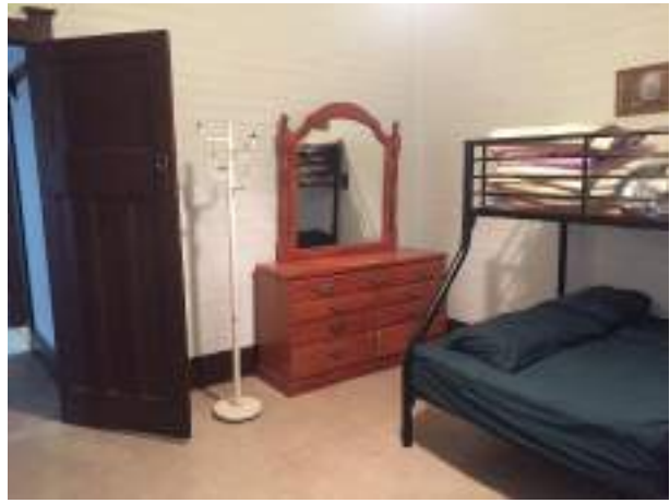
Bedroom – double and single bunk