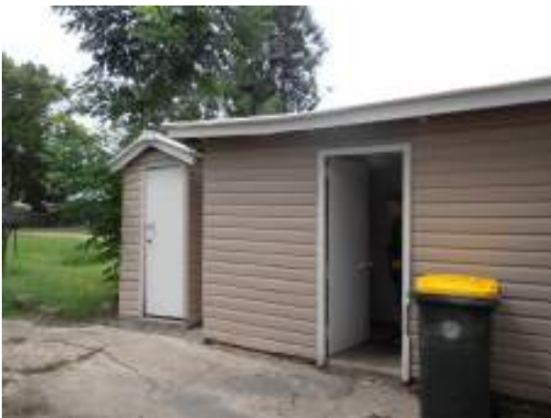
Outside bathroom, toilet and laundry facilities