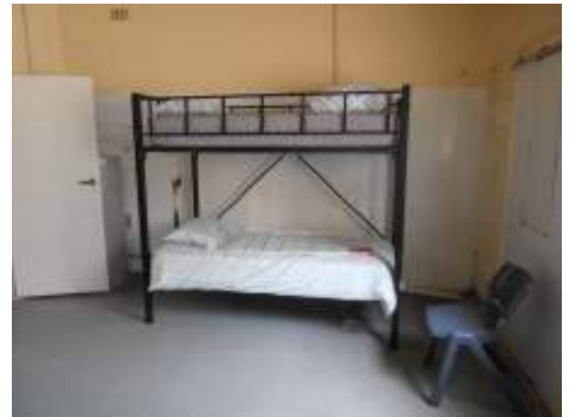
Bunk room – sleeps 6