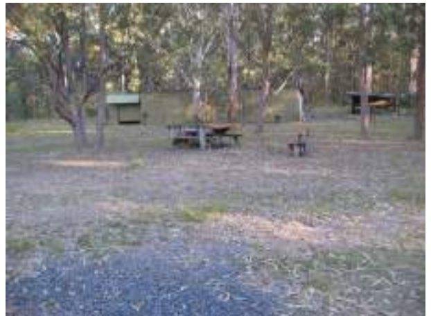
Outside seating area