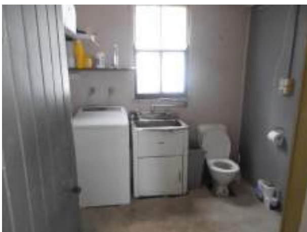
Laundry with additional toilet