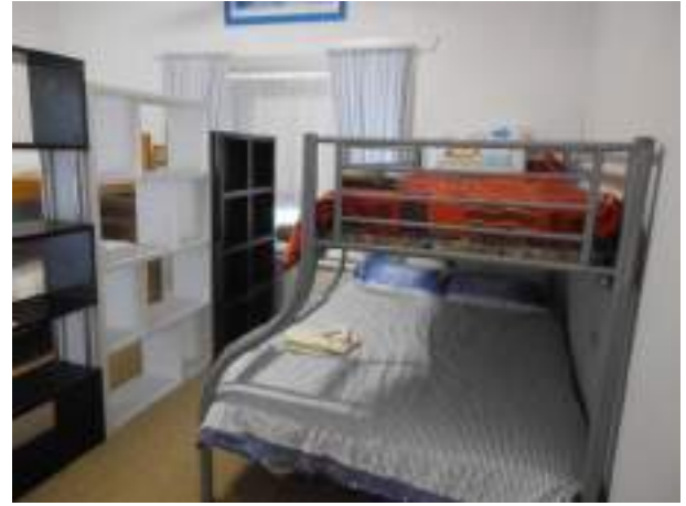
Bedroom 3 – 4 beds plus ensuite divided in the middle by shelving as shown