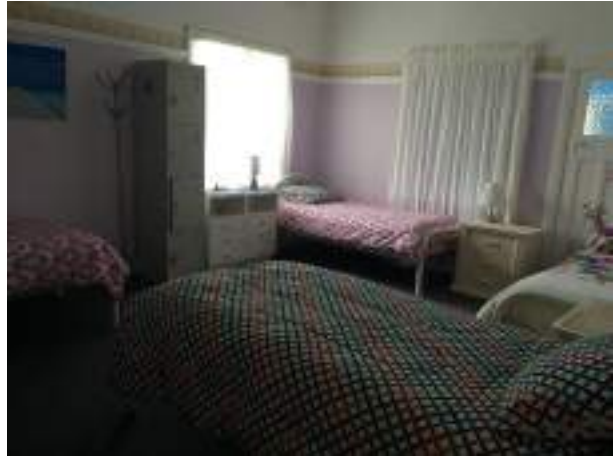
2 x 4 single beds