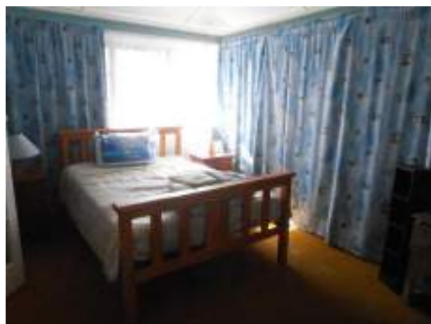
Bedroom 2 – double