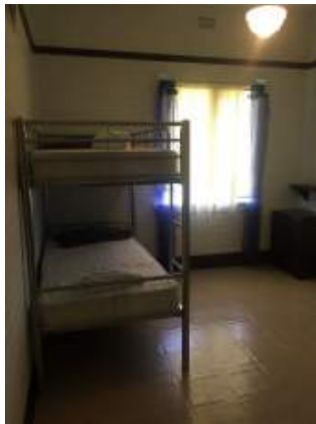
1 of 2 bedrooms with 2 singles (bunks)